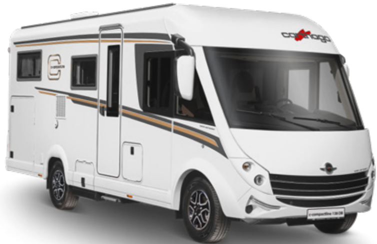
Model: c-compactline I 138 DB

The lightest motorhome in the A class 3.5 t Premium class, suitable for remote areas thanks to the 15 cm narrower exterior width and compact vehicle lengths