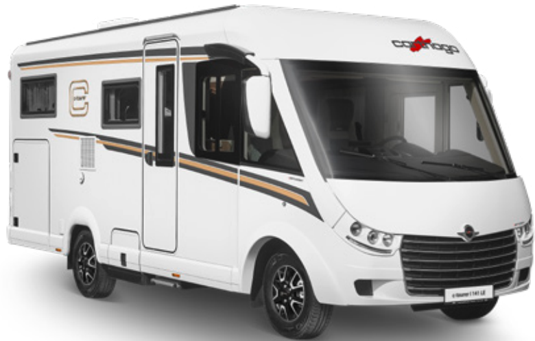
Model: c-tourer I 141 LE*

The sophisticated all-rounder – Lightweight models, practical for requirements in the 3.5 t weight class!